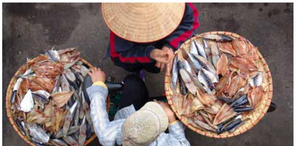
Vietnamese street vendor