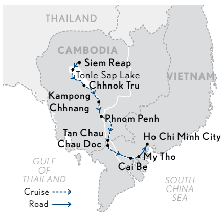
Angkor Wat, Cambodia

Book your international flights with Abercrombie & Kent and receive $500pp off your airfare