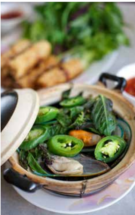
Vietnamese mussel soup

This morning, visit Koh Chen, a silversmith village known for its fine craftsmanship.