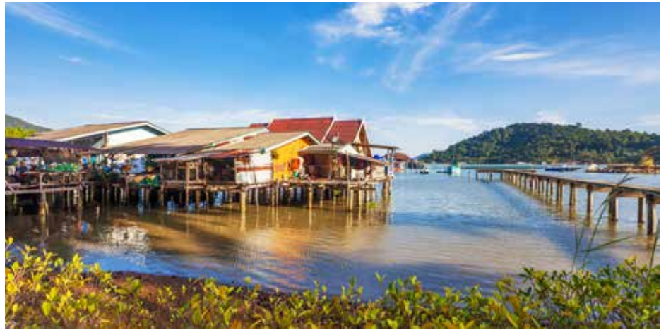
Tonle Sap Lake, Cambodia