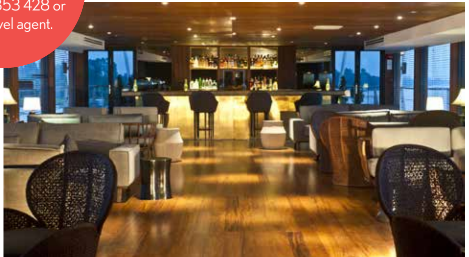
Indoor Lounge, Aqua Mekong

International flights, visas, insurance coverage of personal loss, injury, illness or damages incurred during your trip; items of a purely personal nature such as drinks, laundry, dry cleaning, internet, fax or phone charges; transfers/ sightseeing or meals not specified in itinerary; excess baggage charges; tipping to A&K tour escort. Tipping is not expected or required for Guest Host.